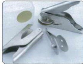
Pocket Seal Protected By Transparent Casing