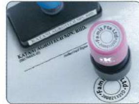
Company Official Stamp