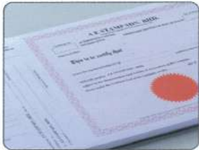
Company Share Holders Certificate