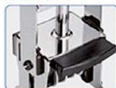
Easy and clean pad exchange

Steel equals stability and durability without compromise.