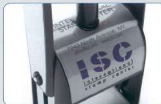
Image window shows imprint and even offers space for further personalisation