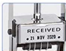
Window offers space to show imprint