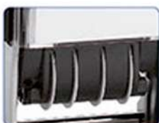
Band cover for clean handlings