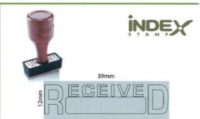
39mm 12mm RECEIVED INDEX STOCK STAMP RM 5