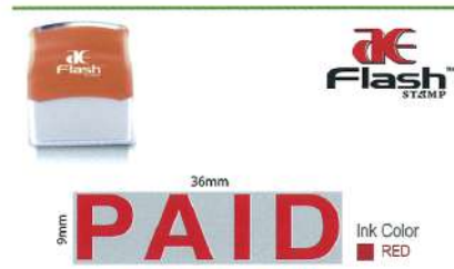
36mm 9mm PAID Ink Color RED A E STOCK STAMP RM11