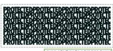
AVAILABLE IN BLACK INK ONLY