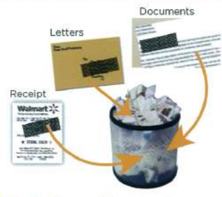
Printer 30 Incognito max. 18 x 47mm RM 26 E/30 RM 9