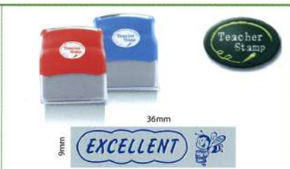
36mm 9mm EXCELLENT TEACHER STAMP RM11